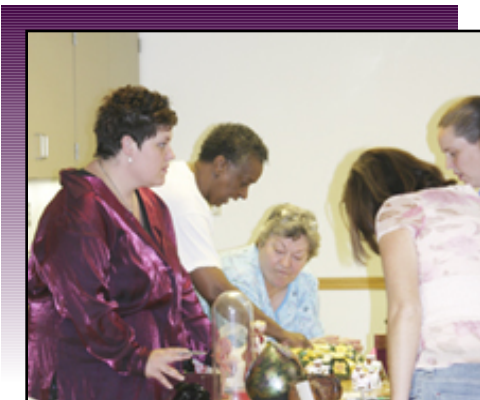
Members check out polymer clay artwork at the "Show & Tell" table.

(If you order one, mention that you saw Sue demo it at a meeting).